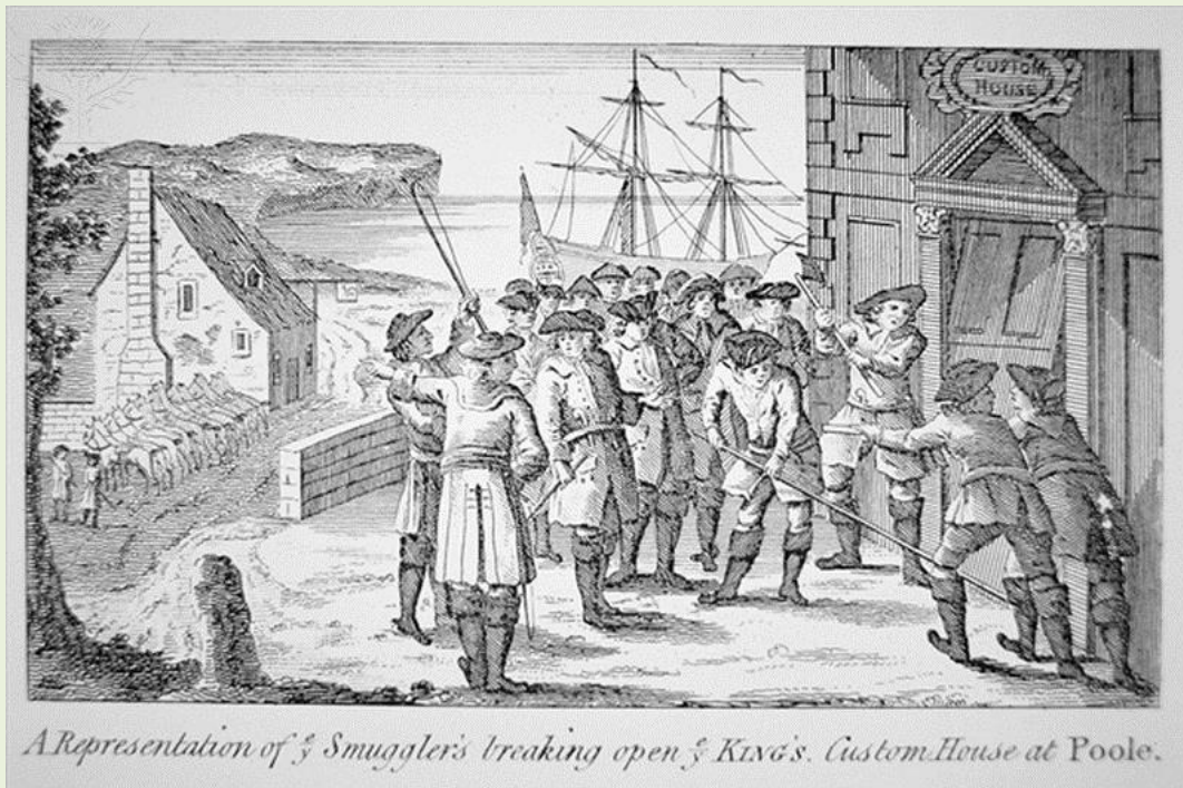
Smugglers breaking open the King's Custom House, Poole, Dorset / Credit: Bridgeman Art Library / Universal Images Group / Copyright © Bridgeman Art Library / For Education Use Only. This and millions of other educational images are available through Britannica Image Quest. For a free trial, please visit www.britannica.co.uk/trial

An image of a group of smugglers called the 'Hawkhurst Gang' breaking into the custom house in Poole, Dorset. This armed group were not opposed during the event. Many of the local residents turned a blind eye or supported them. They were not afraid to use violence.